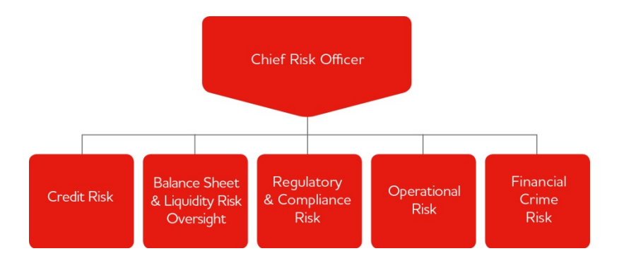
Chart 4: Group Risk Management Function

The Group's risk management function as at 30 September 2016 is represented below.