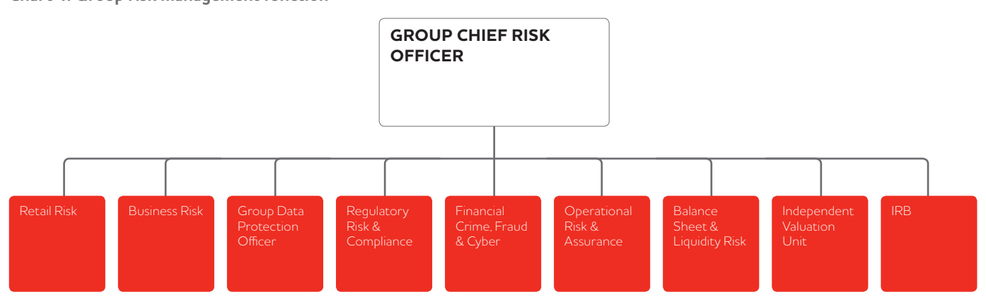
Chart 4: Group risk management function

The Group's risk management function as at 30 September 2017 is represented below: